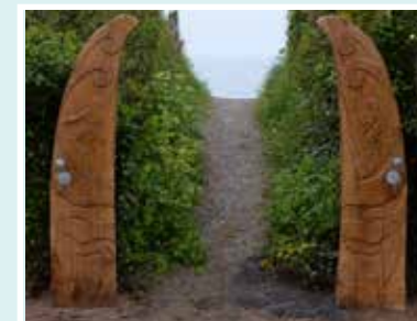
Surf / Windsurf Arch at Horton Bay Cerflun o Fwa Syrffio/Hwylfyreddio ym Mae Horton by/gan Sara Holden