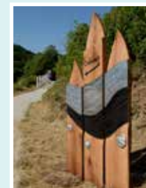
Surfboards & Fish at Caswell Bay Byrddau Syrffio a Pysgod ym Mae Caswell by/gan Ami Marsden