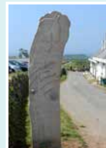
White Horse Sculpture at Rhossili Bay Cerflun Ceffyl Gwyn ym Mae Rhossili by/gan Sara Holden